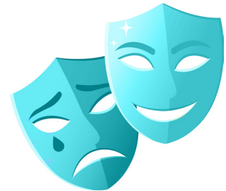
Amelia G. Tapper Center For The Arts